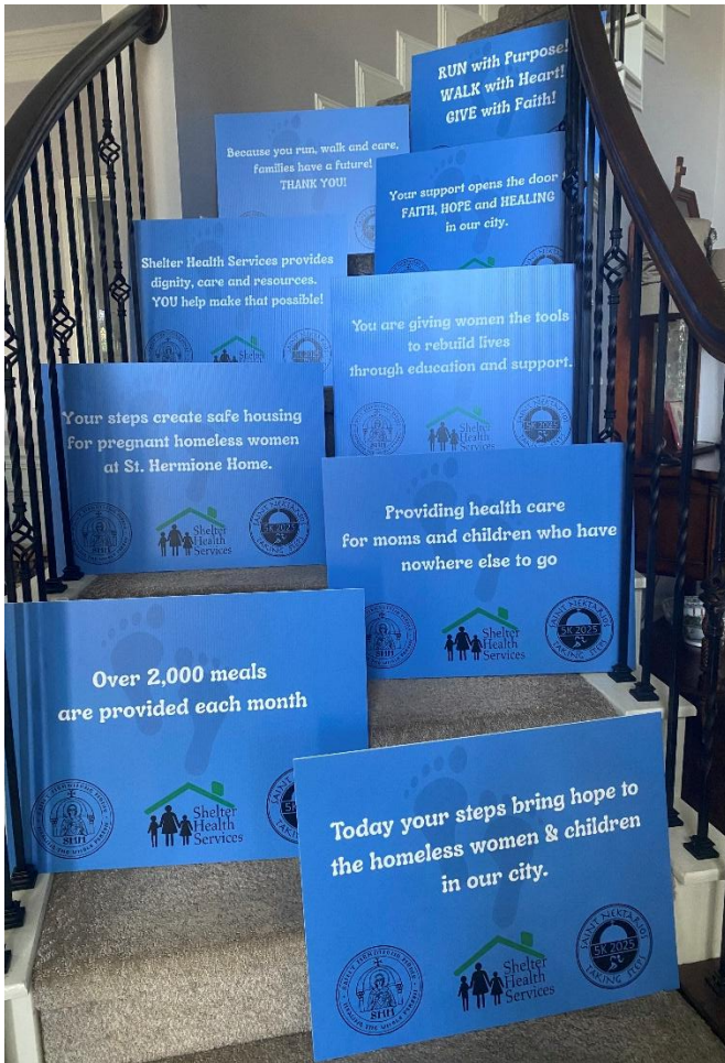
Signs displayed along the race route