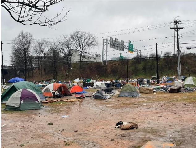
Pictured above: a tent city served by SHH during COVID

St. Hermione Home (SHH) began in its earliest iteration in early 2017 with a visit to Shelter Health Services, a completely free medical clinic within the Center of Hope/Salvation Army, in the inner city of Charlotte, NC. During this visit, I was invited to initiate an Orthopedic Clinic there. During the early years of providing medical services, it became clear that the served population was also hungry for further spiritual nourishment. Thus in 2019, a weekly Bible Study & Support Group was inaugurated there.