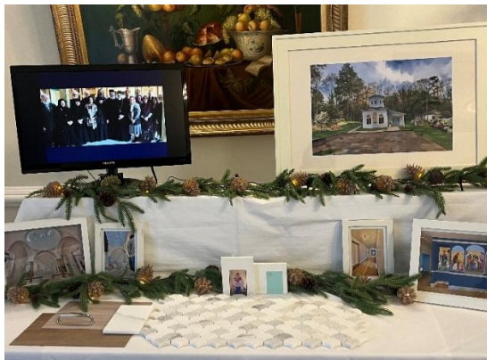
Display of our building progress and materials