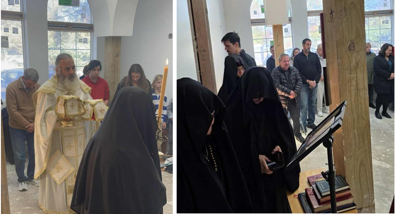
Pictured above: Divine Liturgy at the St. Hermione Home Chapel attended by the SHH Ministry Team, Board of Directors and Board of Advisors in the fall of 2025