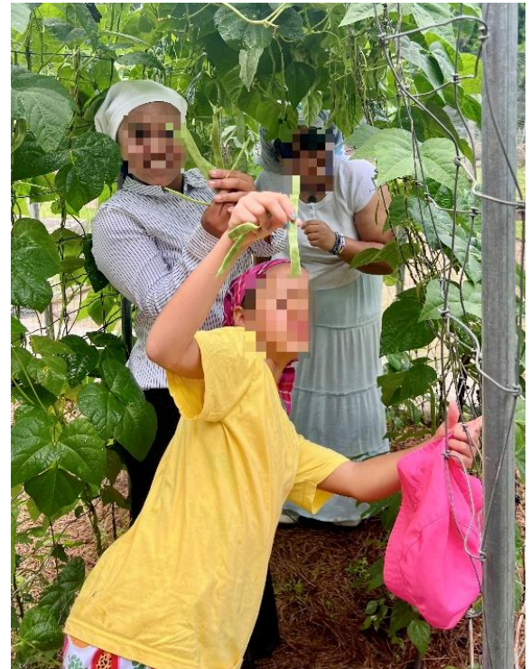
Pictured above: two daughters learning to garden with their mother