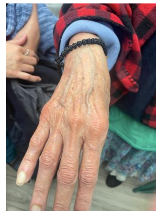
Pictured Above: A woman who had suffered for a long time with a troublesome rash on her arm was cured after wearing her prayer bracelet.

Both Cross Necklaces and prayer bracelets are considered support and coping tools. They are something to hold onto and meditate on God and life. They give comfort in providing a reminder to pray and to hold onto hope.