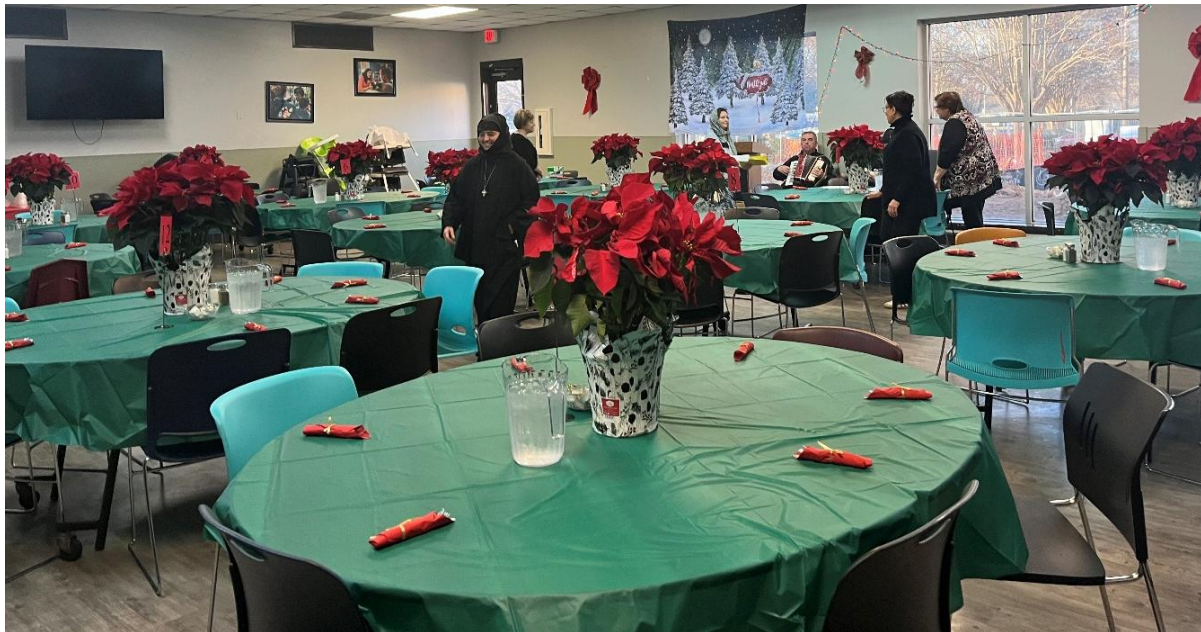
Pictured above: The dining room was transformed into a place of celebration and peace.

The operations of St Hermione Home Ministries has grown significantly in 2025. The Lord has seen fit to provide growth in our ministry programs and in our ministry team. It is an honor to serve the Lord with St. Hermione and her ministry team.