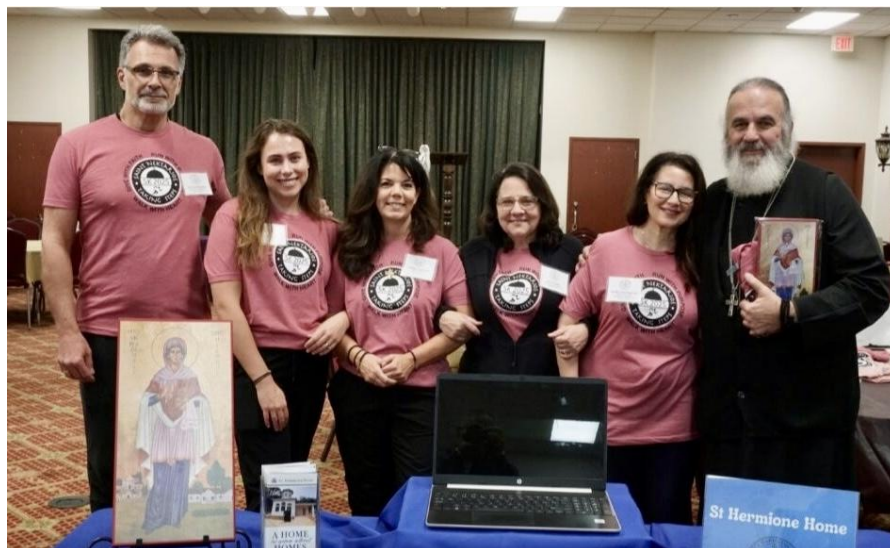
SHH Team available for questions before and after the race.