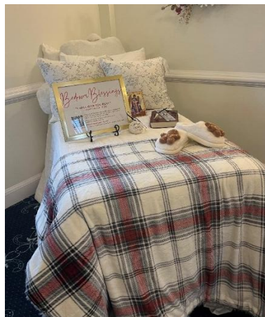
A representation of the living room and mother's bedroom in the SHH Maternity Home