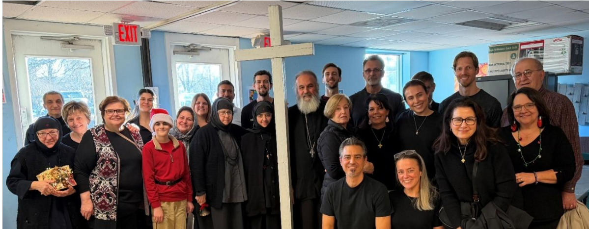
Pictured above: A quick team picture after prayer and before serving the Christmas Dinner

SHH offered a special Christmas Dinner to all residents in the SACOH on 12/23. We also serve those who are living outside and we estimate that over 300 people were fed during this event. It is a blessed time of fellowship and Christmas Joy.