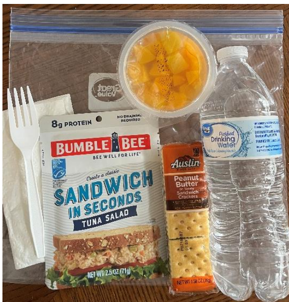
Pictured: Ambulatory Meal Bag

The third way in which SHH feeds the hungry has been going on the longest. Every Tuesday at the SHH Bible Study & Support Group we share a Fellowship Meal with those living in and around the Shelter at the time of BSSG. This program feeds about 110+ people every Tuesday Night.