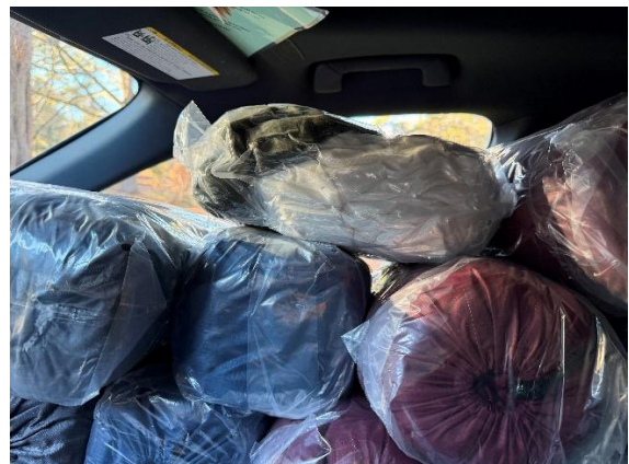
Pictured Above: A picture taken from the driver's seat looking to the right at the filled passenger's seat – blankets filled to the ceiling of the SUV

*Upon arrival in the inner city, this SUV that has been loaded to the max. The needs we are experiencing are this great – there will not be anything left in this vehicle in a matter of 15 mins...and there will be new faces tomorrow that are without any winter clothing or blankets. Lord have mercy!