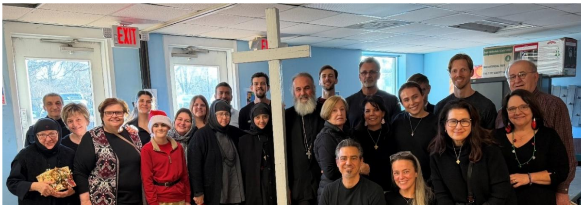
Pictured above: A team picture after prayer and before serving the SHH 2025 Christmas Dinner