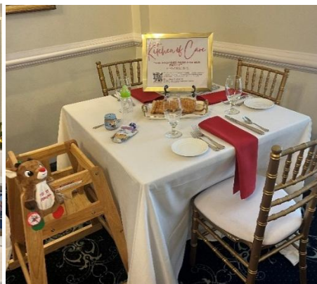
Representation of the SHH Maternity Home Kitchen