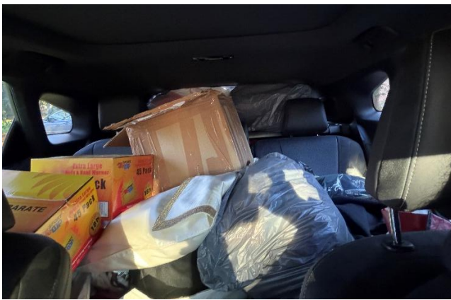
Pictured Above: A picture taken from the driver's seat looking back at the filled SUV – you can see boxes of hand warmers, blankets and winter coats.